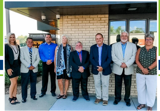
Your Elected Township Officials

FALL/WINTER 2022 www.waucondatownship.com