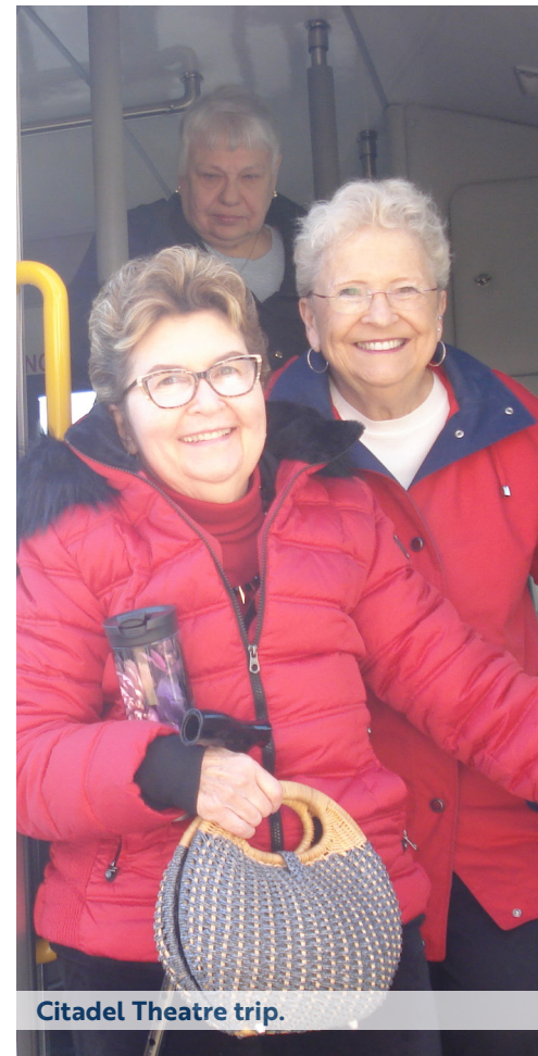
Citadel Theatre trip.

All payments must be made by check, credit card, debit card or money order. NO CASH ACCEPTED.