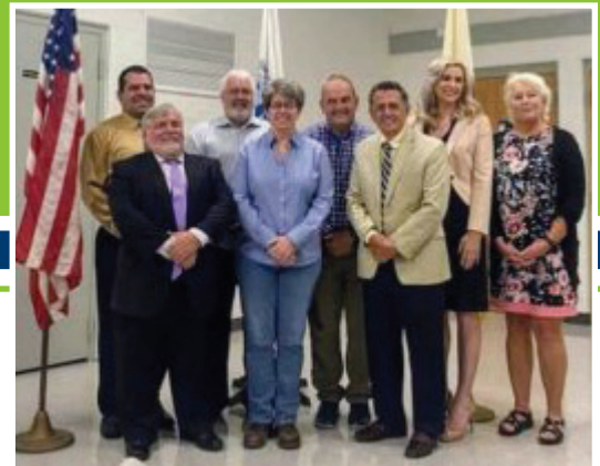
Your Elected Township Officials

SPRING/SUMMER 2022 www.waucondatownship.com