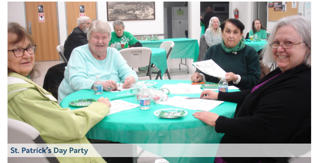
St. Patrick's Day Party