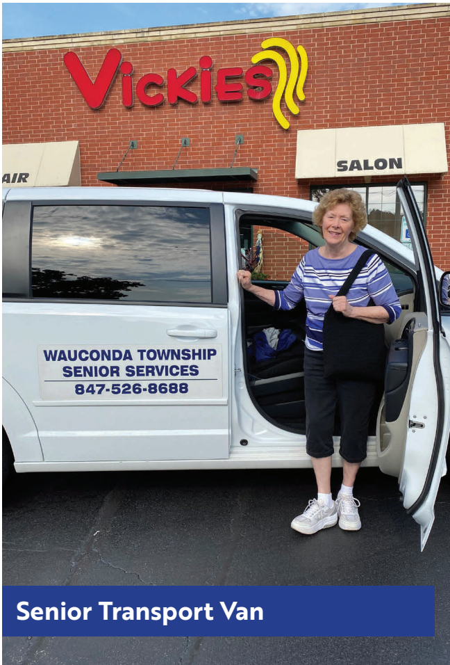
Senior Transport Van