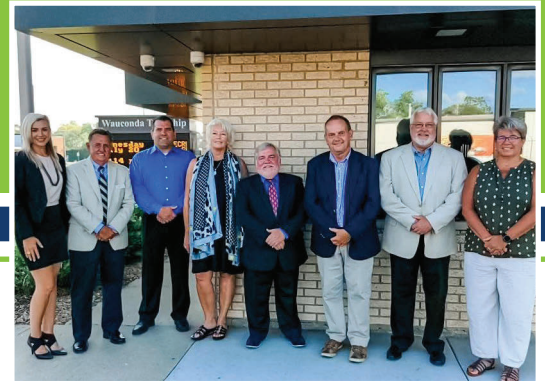
Your Elected Township Officials