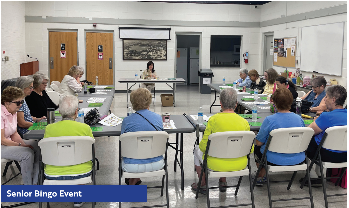
Senior Bingo Event