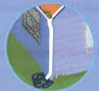
Clogged rain gutter (home and street)