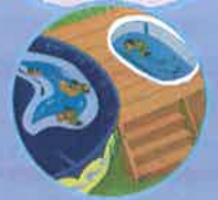
Pool cover that collects water, neglected swimming pool, hot tub or child's wading pool