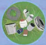
Trash and discarded tires (drill drain holes in bottom of tire swings)