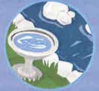
Birdbath (clean weekly) and ornamental pond (stock with fish)