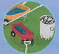
Any toy, garden equipment or container that can hold water