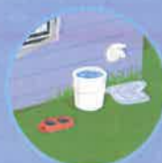
Leaky faucet or pet bowl (change water daily)