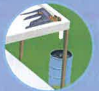
Flat roof without adequate drainage