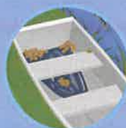
Uncovered boat or boat cover that collects water