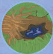
Tree rot hole or hollow stump